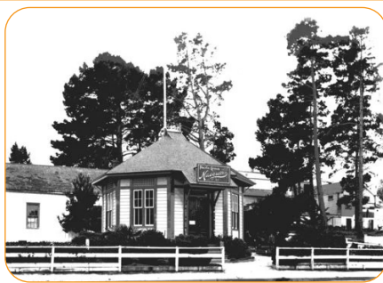
1883.